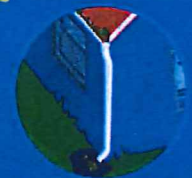
Clogged rain gutter (home and street)