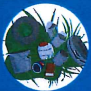
Junk and discarded tires (drill drain holes in bottom of tire swings)