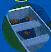
Uncovered boat or boat cover that collects water