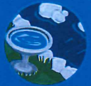
Birdbath (clean weekly) and ornamental pond (stock with fish)