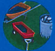
Any toy, garden equipment or container that can hold water