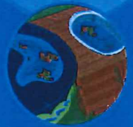
Pool cover that collects water, neglected swimming pool, hot tub or child's wading pool