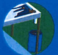
Flat roof without adequate drainage