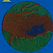
Tree rot hole or hollow stump